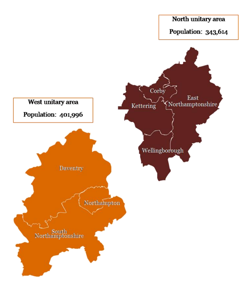
Figure 1: Proposed unitary areas